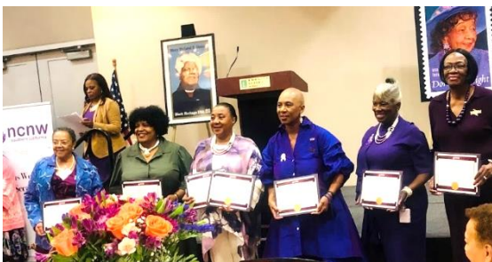
2023 SoCal Bethune Achievers