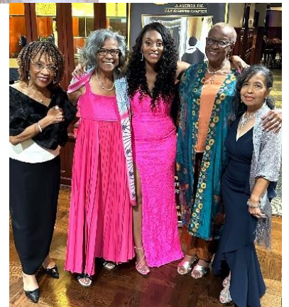
Pictured Above & Right: SGV-NCNW members enjoying the Award ceremony and Gala.