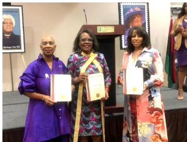
2023 SoCal Legacy Life Members