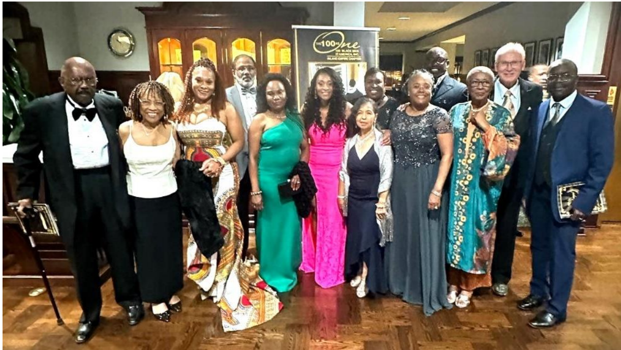
SGV-NCNW members and associates attended the Partnership Award ceremony.