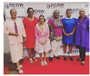
SGV-NCNW members attend the Bethune Height Recognition Program