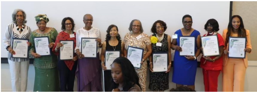
SGV-NCNW Board Members