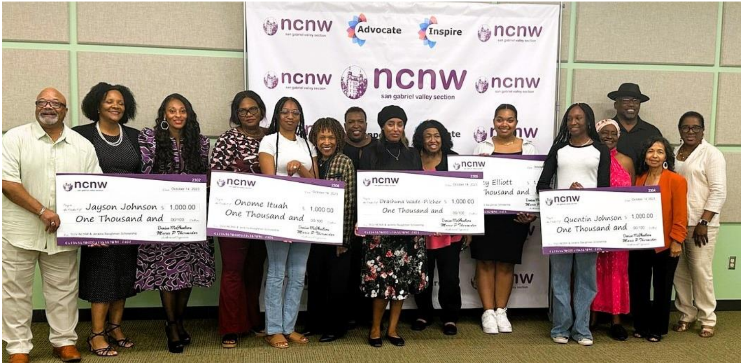
Scholarship recipients with parents and SGV-NCNW Board members.

On October 14, 2023 at its Scholarship Awards Luncheon, SGV-NCNW awarded five (5) $1000 scholarships to the recipients of the 2023 SGV-NCNW and Jenkins Baughman Family Scholarship. Recipients were as follows: