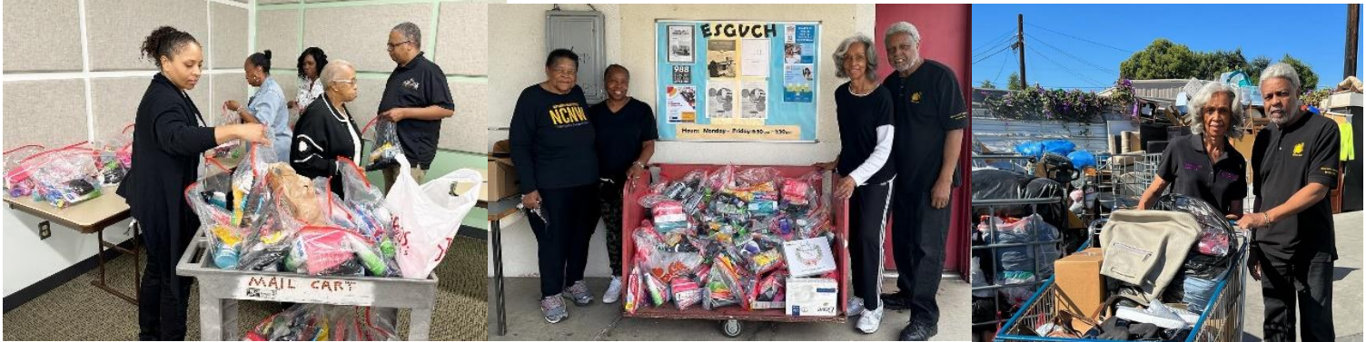
SGV-NCNW members package and deliver hygiene items and clothing to ESGVCH and House of Ruth.

November 4, 2023 was a busy weekend for our Community Service team and members. The team packaged hygiene kits for the homeless and gently used clothing for the House of Ruth Thrift Store. The hygiene kits were delivered to the East San Gabriel Valley Coalition for the Homeless. Patrons of the House of Ruth are given vouchers to shop at the Thrift Store. SGV-NCNW pulled together donations to contribute to this cause. Continue to save your clothing for women, men, and children for this donation.