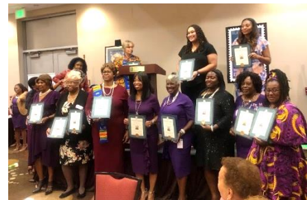
2023 SoCal Life Members