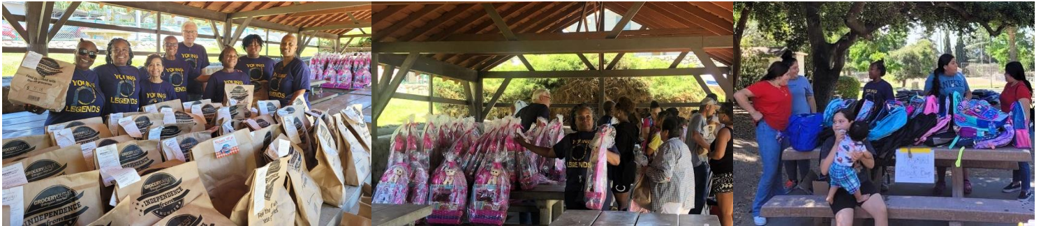
SGV members passed out bags of groceries, children toys, and backpacks.